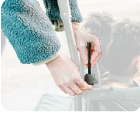
Retractable Canopy Rods