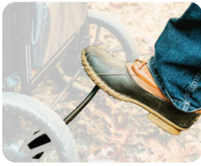
Easy One-Step Foot Brake