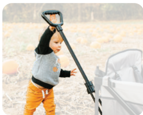
Telescopic Pull Handle with Spring Bounce