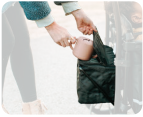
Removable Rear Basket with Zipper Cover