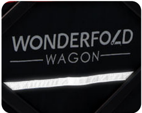
Reflective Safety Strip