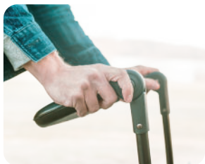
Adjustable Handlebar with a Vegan Leather Cover