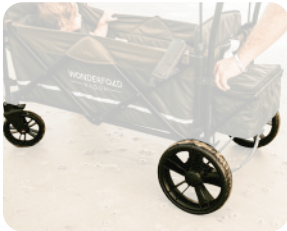
All-Terrain PU Tyres with Bearings & Suspensions