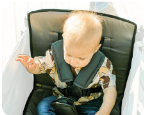
Removable Seat Pads with 5-Point Safety Harnesses