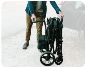
Easy to Fold & Unfold